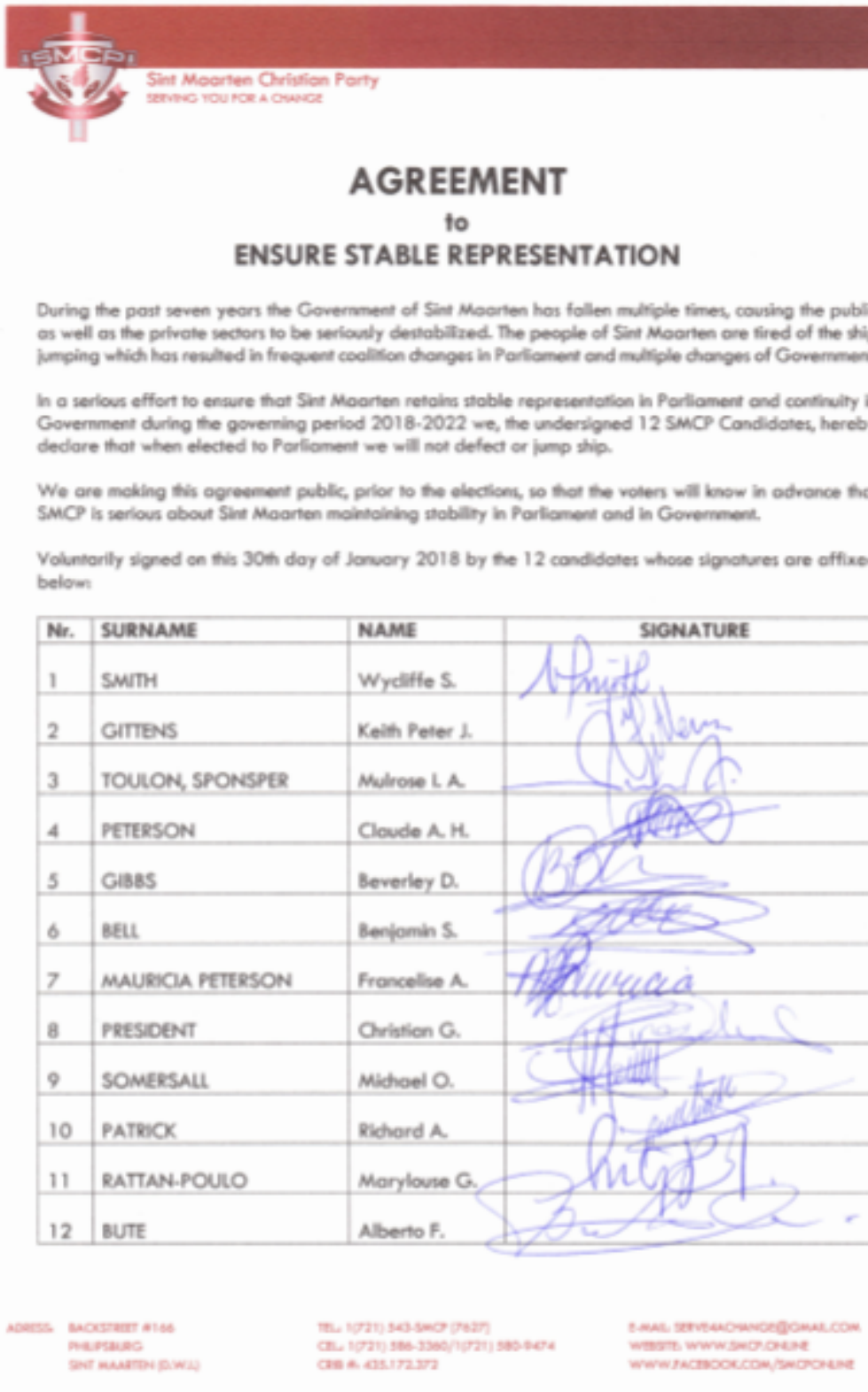
Table 2: Agreement to Ensure Stable Representation